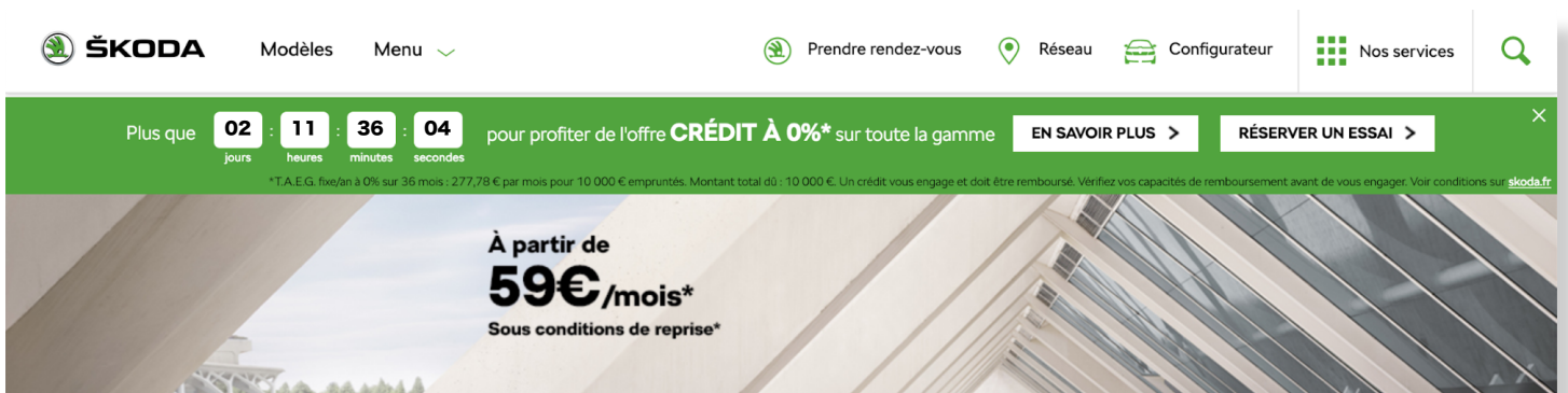
Countdown clock on desktop