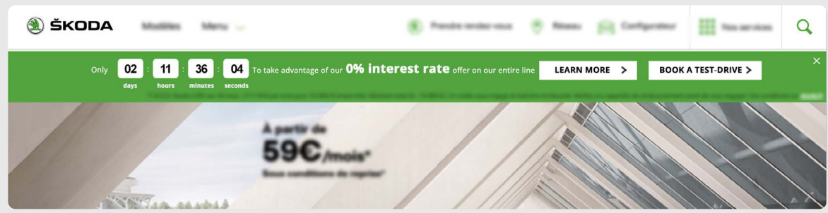
Countdown Clock on Desktop